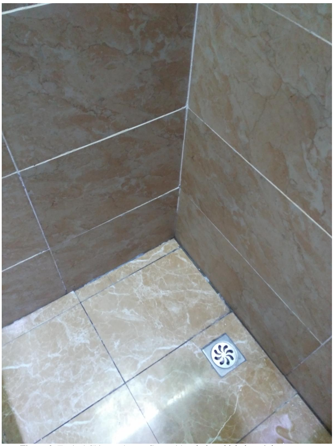
Figure 2. Typical Chinese shower floor with a drain, which doesn't have a trap.