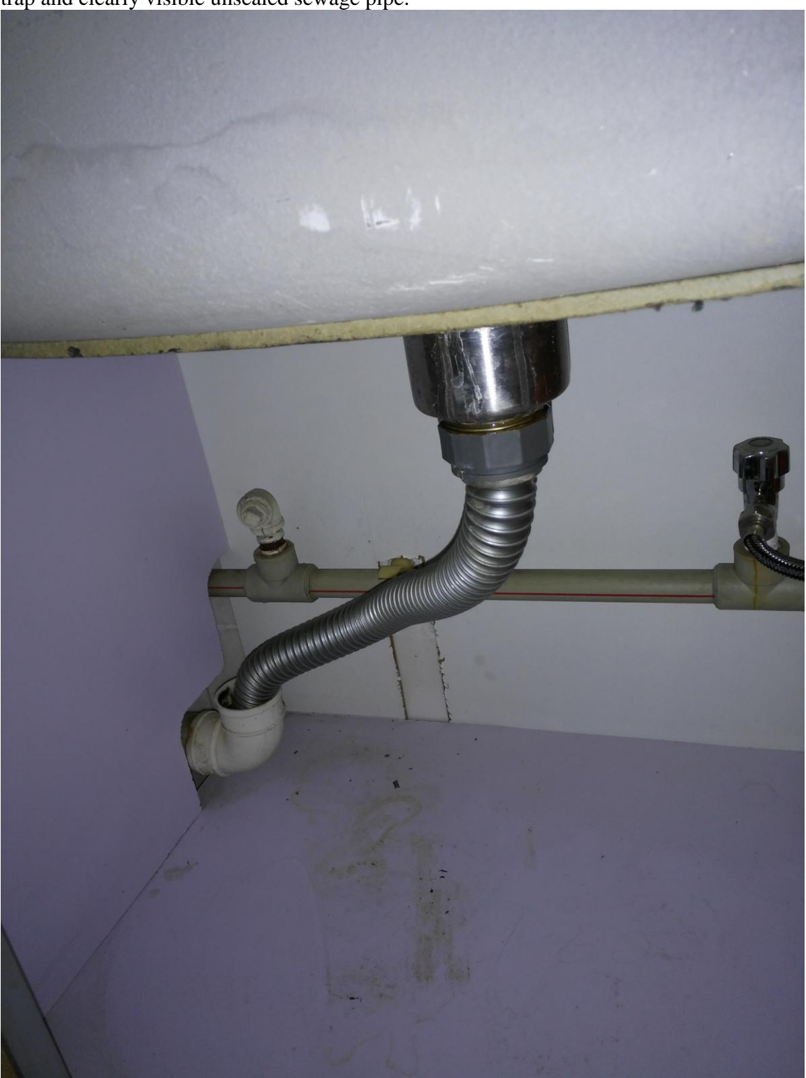
Figure 3. Flexible pipe connection in the kitchen without the water trap showing exposed unsealed drain pipe.

trap and clearly visible unsealed sewage pipe.