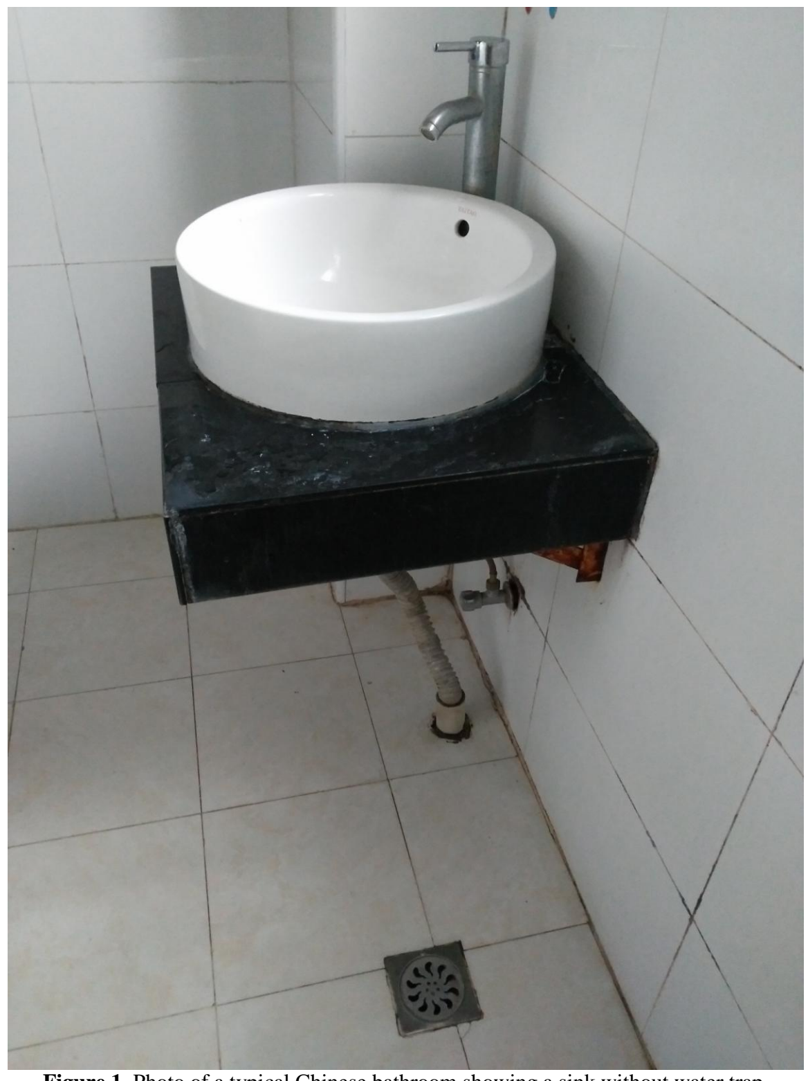
Figure 1. Photo of a typical Chinese bathroom showing a sink without water trap, unsealed sewage line and floor drain without a trap.